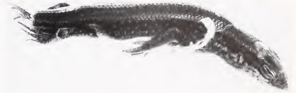
FIG. 3. Holotype of Mabuya quadratolobus Baur and Günther (NMBA 10275). Note general coloration pattern.

from Buksa (=Buxa), near the Bengalese/Bhutan frontier, but later described the same specimen as J. bengalensis , now regarded as a synonym of J. variegata .