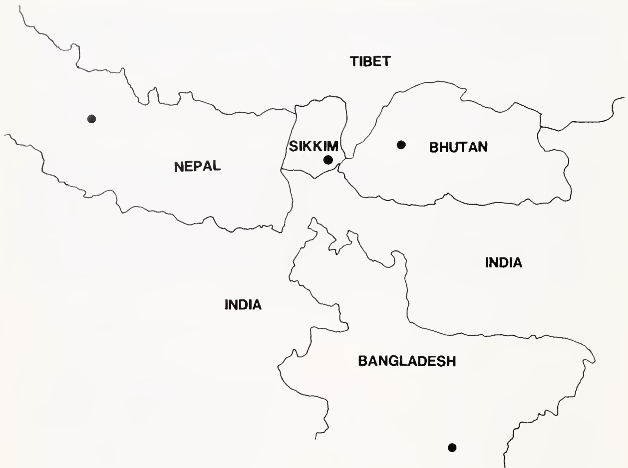
FIG. 1. Map of the eastern Himalayas and adjacent regions showing the position of Bhutan. Closed circles indicate the capital cities of each country.