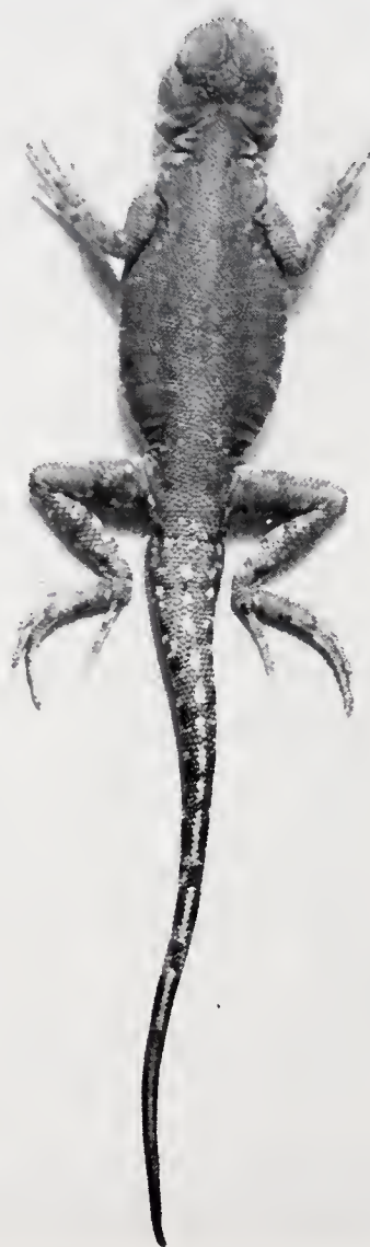
FIG. 5. A specimen of Phrynocephalus versicolor from Djungar Gate (Djungar Railway Station) with light longitudinal caudal stripe.

In summary, it appears that only two subspecies of the variegated toad agama can be recognized. P. v. kulagini inhabits southern Tuva and northwestern Mongolia and forms a narrow zone of intergradation with the nominative subspecies P. v. versicolor . However, there are doubts that the axillary red spots constitute a characteristic which allows one to delineate populations specifically on the level of geographaia race, i.e. subspecies. It is possible that P. versicolor consists of isolated, genetically differentiated color morphs associated with stabilized soils. Taxonomic separation of these variants should occur only after a detailed study of the entire group. Bedriaga (1909) recognized five subspecies and considered P. versicolor to be a species composed of many highly variable populations. Bedriaga expressed concern that his taxonomic arrangement of these subspecies did not represent a natural assemblage.