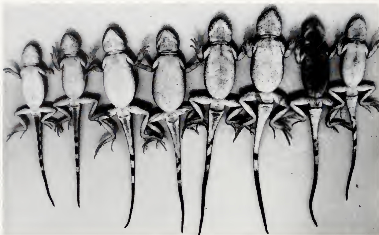
FIG. 4. Ventral view of Phrynocephalus versicolor from Djungar Gate (Djungar Railway Station).

hispidus can be noted. It is important to note that the subcaudal surface in living lizards of both sexes is a red-orange color, that with age loses its lustre and disappears (Fig. 4). We also discovered remnants of the red-orange coloration in one of 13 specimens from "Alakol Depression" (Zoological Museum of Moscow State University, MSU R7779). Recently we examined specimens from China with the same subcaudal coloration in the California Academy of Sciences collected in the central (northeast of the city of Karamay) and southeastern (east from the city of Urumqi) Djungaria. In all specimens examined there are dark transverse bars on the ventral tail surface and this agrees with Bedriaga (1909) but not with Semenov (1986).