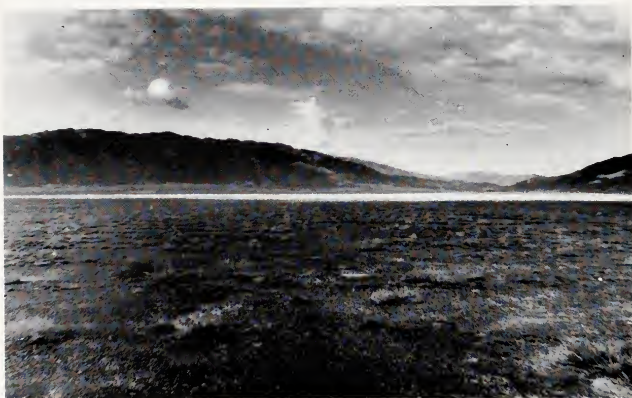
FIG. 2. Habitat of Phrynocephalus versicolor in Djungar Gate near Druzhba Railway Station: crushed-stony and gravel semidesert covered with boyalych ( Salsola orboscula ).