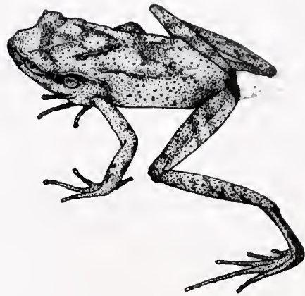
Figure 2. Megophrys daweimontis sp. nov. female X 1.

Paratypes: 17 adult males (KIZ 93069-KIZ 93085) and 3 adult females (KIZ 93086, KIZ 93087, KIZ