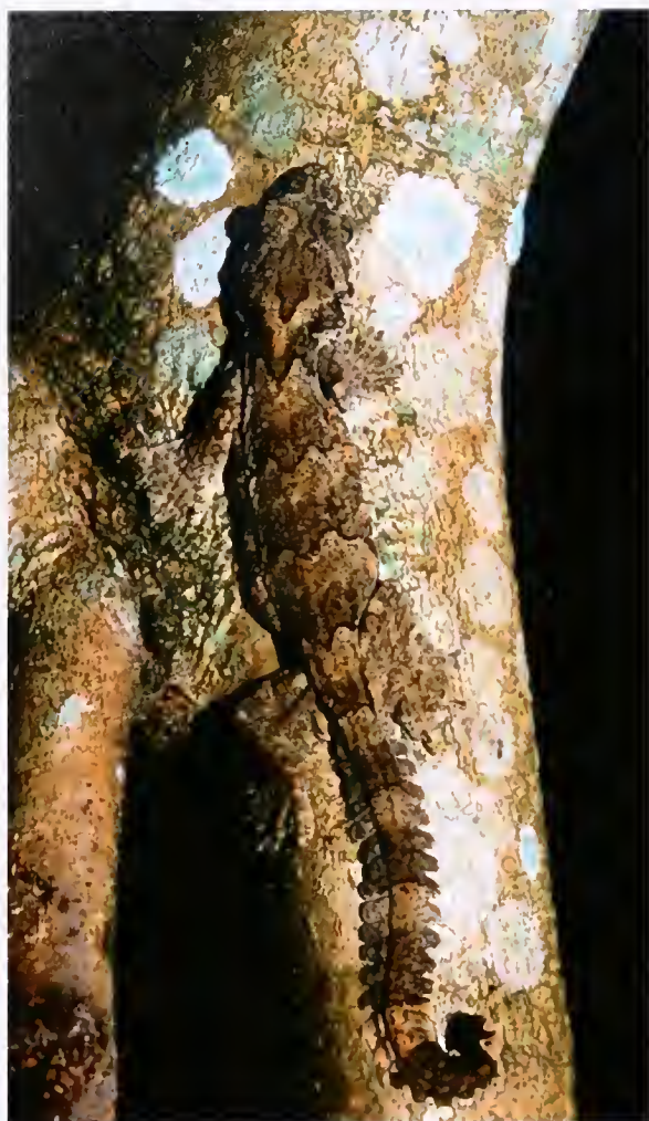
Figure 2. Ptychozoon lionotum (Adult female, BNHM 1445) from Mizoram, northeast India.

On 6th April 1999, SP, along with his field assistant, spotted the second Ptychozoon at 1820 hrs, next to a dirt track in a patch of mature evergreen forest south of NWLS boundary, ~40 km (straight-line) south of the first locality. NWLS is the only remaining patch of unfragmented, mature primary forest in the area, characterized by a three-tiered structure, with towering, buttressed, deciduous emergents up to 50–60m in height, followed by middle and tertiary canopy trees (Pawar, 1999). This area, especially the Ngengpui valley, experiences five rainless months, but the effective dry period is much shorter, with humidity being consistently high during these months due to fine, localized precipitation from cloud and fog. This individual was smaller than the first one and was spotted at a height of 5 m on the trunk of a Sterculia scaphigera tree. The tree is characterized by a deeply fluted trunk and a smooth but slightly flaking bark, and occurs as a deciduous canopy-emergent in pri-